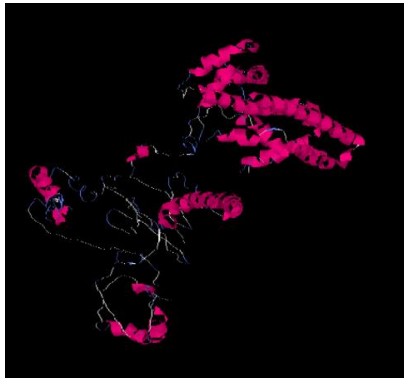
Figure 1. The three dimensional spatial structure of cagA protein using I-TASSER and Discovery Studio Software.