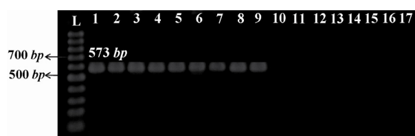
Figure 2. The ptxP amplification using specific primers yielded a product of 573 bp typical to clinical isolates and vaccine strains of B. pertussis . L: 100 bp ladder (Fermentas, Lithuania); 1: Tohama I strain as reference strain; 2-6: clinical isolates of B. pertussis ; 7-9: vaccine strains of B. pertussis ; 10-15: non- B. pertussis clinical isolates; 16: B. parapertussis ; 17: negative control (distilled water)

* Growth rate represents minimum days of appearance of colonies on BGA; Bp: Bordetella pertussis , V: Variable growth patterns